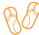
Pool shoes/ sandals